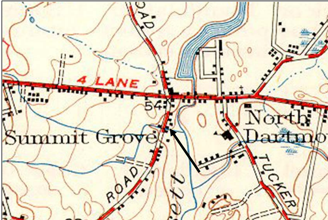
USGS Topographic Map New Bedford North Quadrangle 1941, Revised 1948