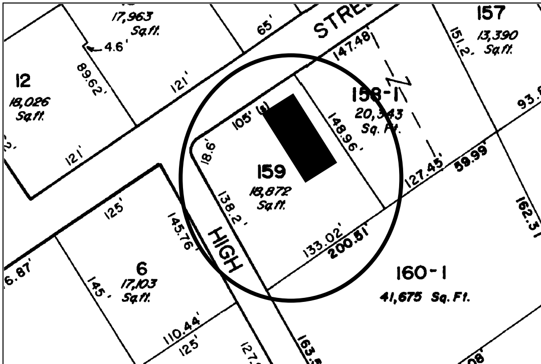
Dartmouth Tax Assessors Map