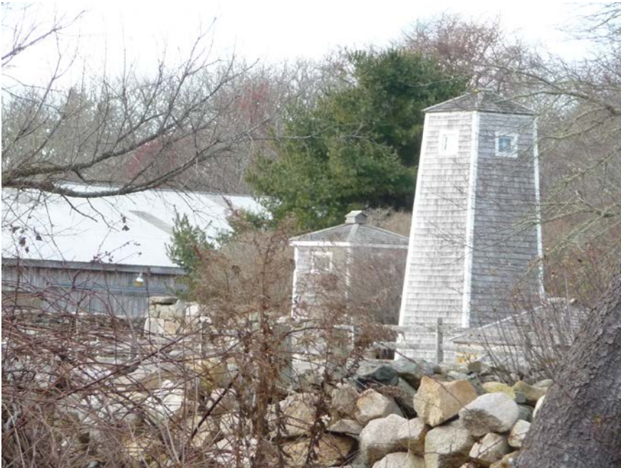
Outbuilding, Windmill, & Well House