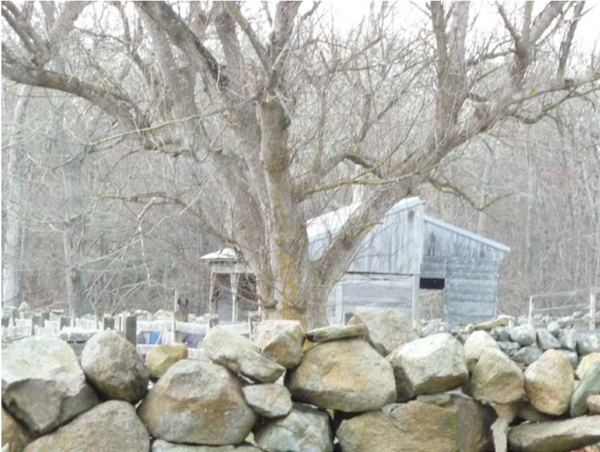
Run In Shelter