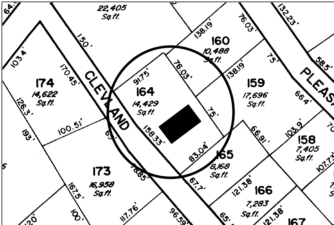
Dartmouth Tax Assessors Map