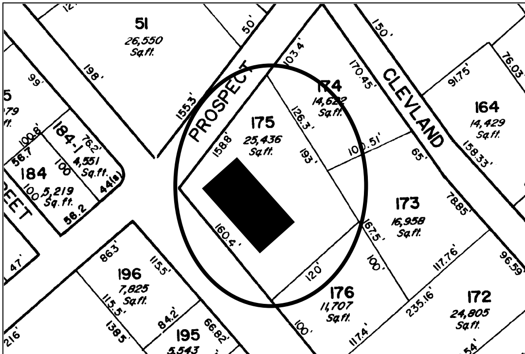
Dartmouth Tax Assessors Map