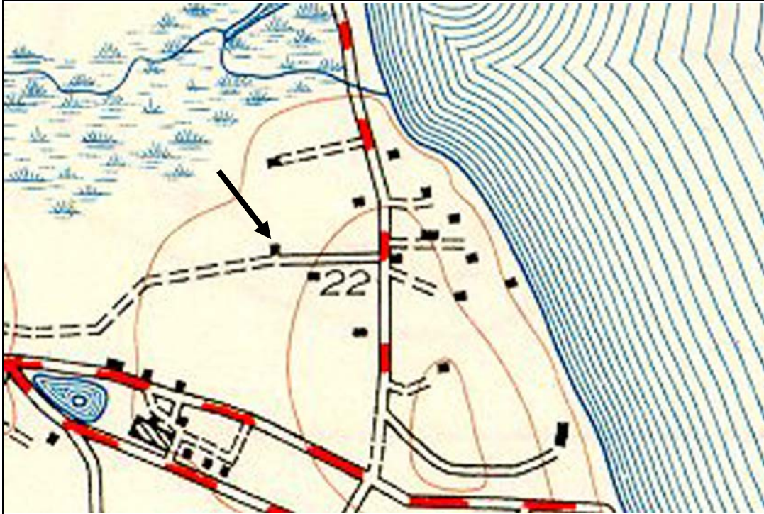
USGS Topographic Map New Bedford South Quadrangle 1941, Revised 1948